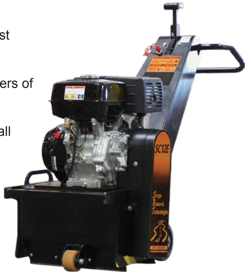
Traffic Marking Removal