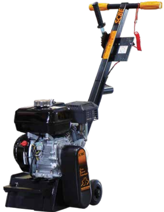
Traffic Marking Removal