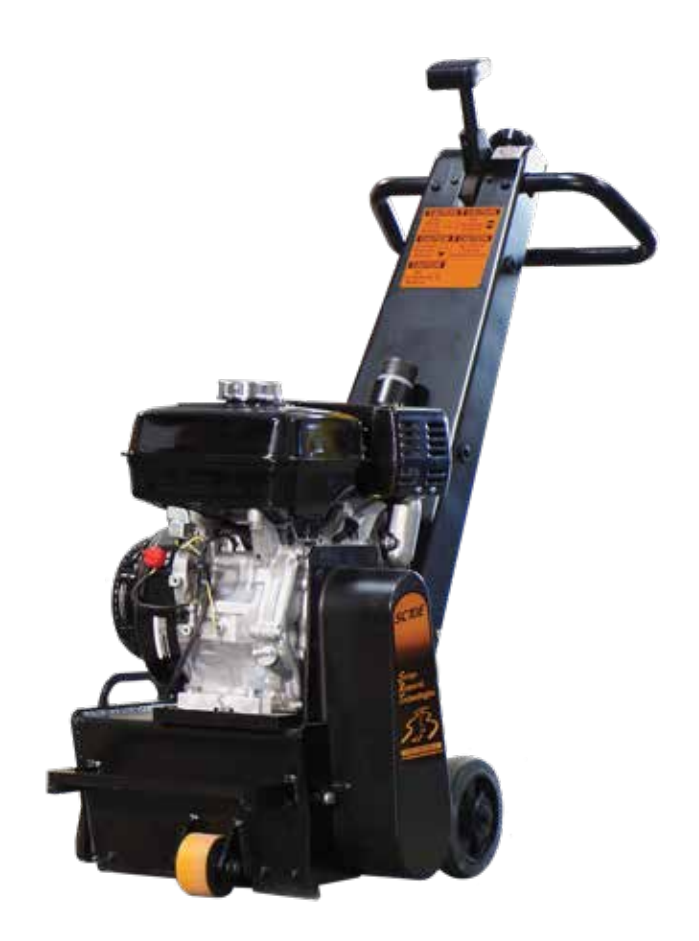
Traffic Marking Removal